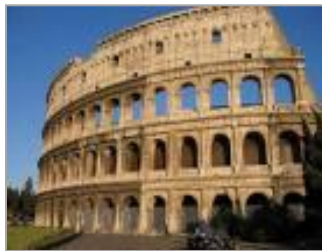
Rome HLF on Harmonisation (2003)