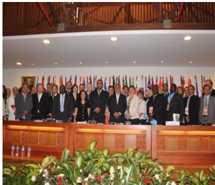
Dili International Dialogue (9-10 April 2010)