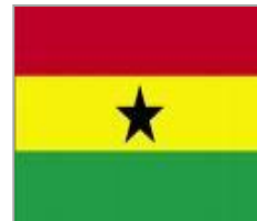
Accra Agenda for Action (2008)