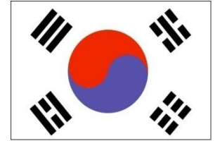
Busan HLF- 4 (29 Nov. – 1 Dec. 2011)