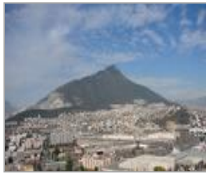
Monterrey Consensus (2002)