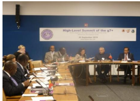
g7+ -Summit of Heads of State in New York 20 September 2010 (Consensus Statement)