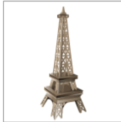
Paris Declaration on Aid Effectiveness (2005)