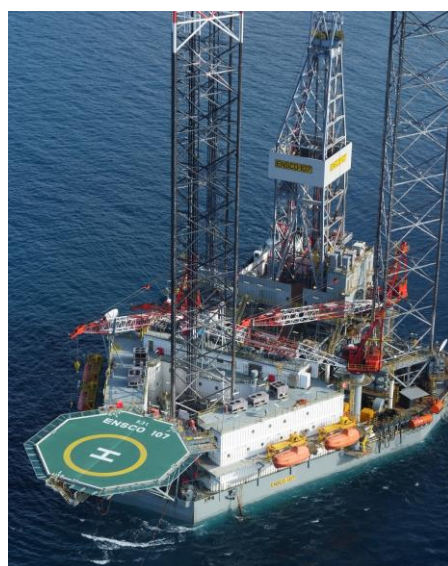
Image of the VALARIS JU-107 drilling rig

As announced on 1 September 2021, the VALARIS JU-107 drilling rig has been contracted to drill the Buffalo-10 well. The rig will move to the Buffalo drilling site once it has completed its current operations which are around 300 kilometres from the Buffalo location. Timing wise, the rig is expected to commence Buffalo drilling operations in early November, namely in around 6 weeks' time. A site survey of the anticipated surface location has been undertaken, with confirmation that the location is suitable for the jack-up drilling rig.