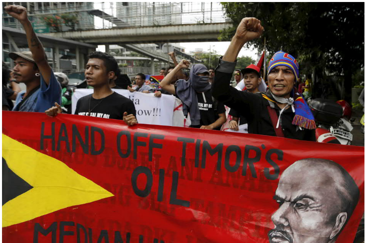
Timorese students shout slogans during a protest in front of the Australian embassy in Jakarta, Indonesia, March 24, 2016.

“We don’t know what kind of agreement has been reached on boundaries, but my guess is that Australia may have compromised on the median line but not on the eastern lateral,” Strating said.