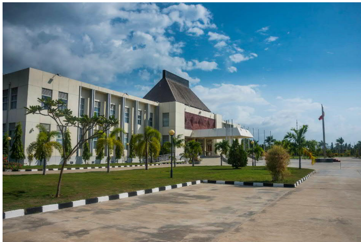
Timor-Leste's new China-built Presidential Palace in Dili.

So, too, have concerns that China's growing infrastructure investment in Timor-Leste, including the construction of ministry offices and a presidential palace alongside funding for the training of hundreds of civil servants, have generated goodwill towards Beijing at Canberra's expense.