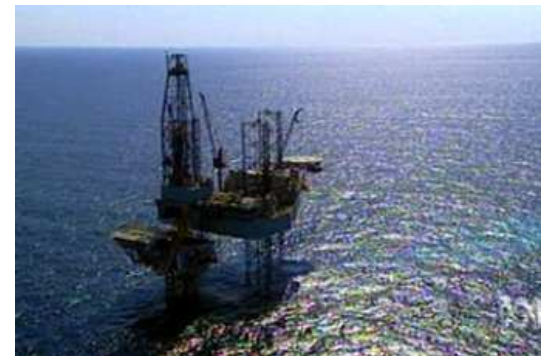
PHOTO: The disputed territory contains large oil and gas deposits worth an estimated $40 billion. (ABC News)

Labor's foreign affairs spokeswoman Penny Wong welcomed the