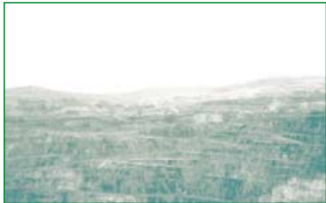
Project Underground ©

In fact, Newmont’s Yanacocha mine – spotlighted on the company’s website as an example of the company’s commitment to social development – has been a longstanding