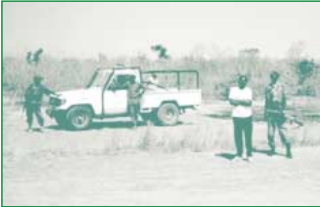
Martin Zin ©