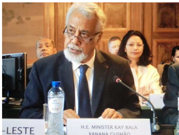
Still fighting for sovereignty, The Hague 29 August 2016

The President of East Timor in a televised address to the nation on the 21st of August made plain the commitment of the State: