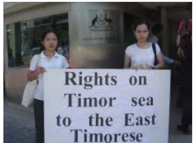
Thai Supporters of East Timor mark Australia Day outside the Australian Embassy in Bangkok.

Bayu-Undan, the largest oil and gas field in the Timor Sea's Joint Development Area, began test production in February, although it will be many months before economically significant oil can be sold (see article on Financial Gap, page 1). Over the next few months, La' o Hamutuk will continue to monitor activities there, as well as analyze plans to use and save revenues from East Timor's oil entitlement. ❖